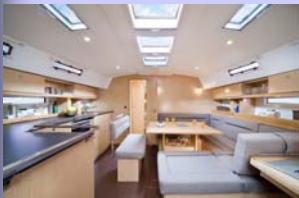
Cruiser 45 Interior

We would welcome the opportunity to sell your yacht.